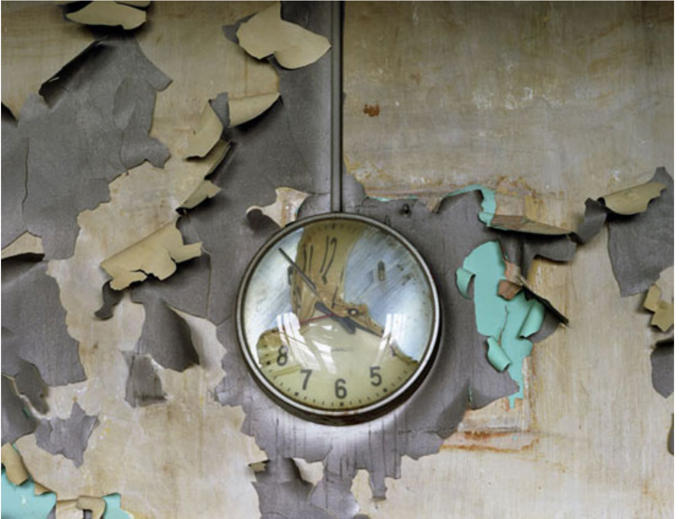
Yves Marchand, Romain Meffre, Melted clock , Cass Technical High School, 2008. Courtesy of the artists.