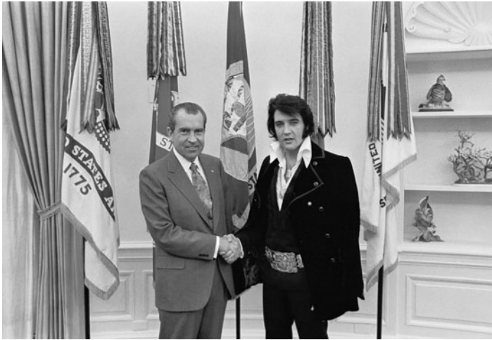
Elvis Presley meets President Richard Nixon, 1970.

Baudrillard was the first thinker to understand this passage in 1976, but some years before that, President Richard Nixon did something very, very farsighted: he canceled the gold standard and the Bretton Woods system, which fixed the relationship between different monies throughout the world. The dollar became, let's say, free, independent, autonomous. And the possibility for a universal measurement of the amount of time needed to produce a thing or a good was effectively gone. Of course, this meant that the United States of America would then decide the exchangeability of the dollar, but according to what terms? The financialization of the economy would use violence in place of measurement. This relationship is not extemporaneous or casual, but absolutely structural: there is no financialization without violence, because violence becomes the only means of producing value in the place of a standard. I will return to this later, but in order to do so, I will first consider how time can be made to forget the bank.