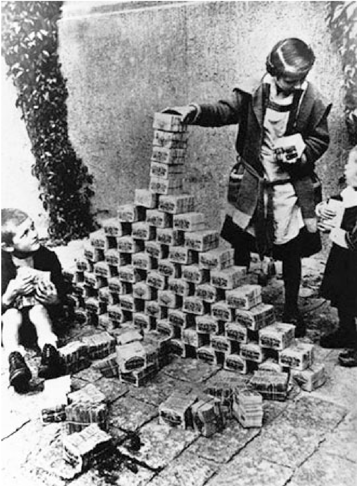
German children playing with money during the 1920s hyperinflation.